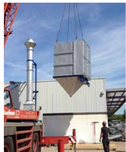
Assembly of a pocket filter AJN 2/603 SL